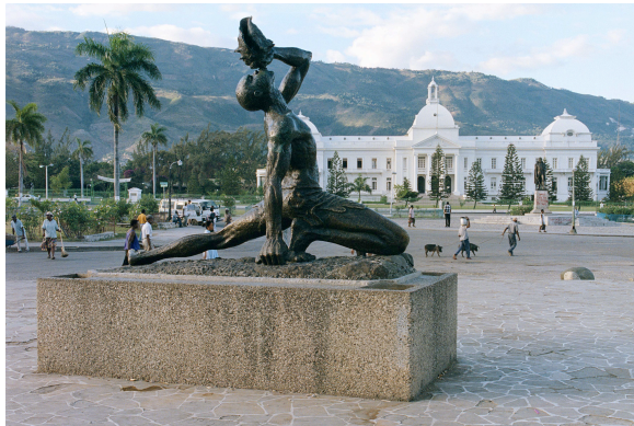
Figure 2: Maroon statue before the earthquake. Keith Mumma, 2009.

Discovered by Columbus in 1492, the western half of Hispaniola became French in 1697, when the treaty of Ryswick divided the island into French St Domingue to the West and Spanish Santo Domingo to the East. As a result of being the wealthiest colony in the Caribbean, St. Domingue soon became known as the “pearl of the Antilles”. Using labor from the more than five hundred thousand Africans brought as slave labor to the colony’s plantation, St. Domingue supplied France most of its coffee, sugar, rum and cotton. A slave revolution led to a twelve-year war between St. Domingue’s slaves and free mulattoes. This culminated in the independent Republic of Haiti in 1804, making it the first black republic, the second independent nation in the new World and the only successful slave revolution. It is also one of the few Caribbean nations to endorse African-derived linguistic and religious practices. Haitian Creole stands alongside French as an official language and Voodoo is an official religion. Today Haiti has an estimated population of over 9 million people (9,035,536, July 2010 estimate). The population is decidedly