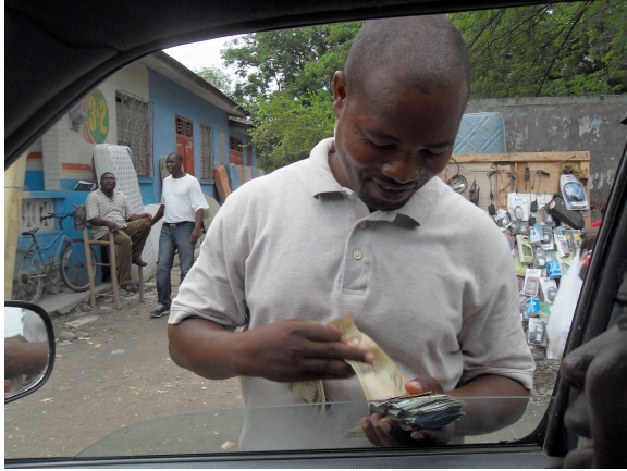
Figure 6: Moneychangers on the street selling to SUV owners.

strength and works as a deterrent to the potential robber, while also providing companionship during the slow moments of the day.